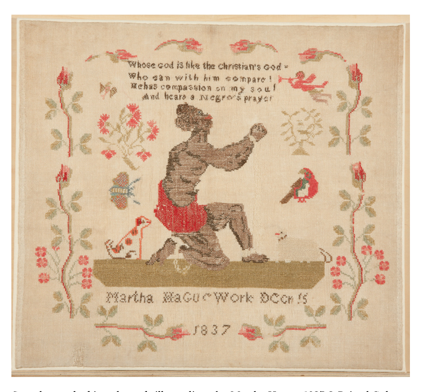
Sampler worked in coloured silks on linen by Martha Hague, 1837