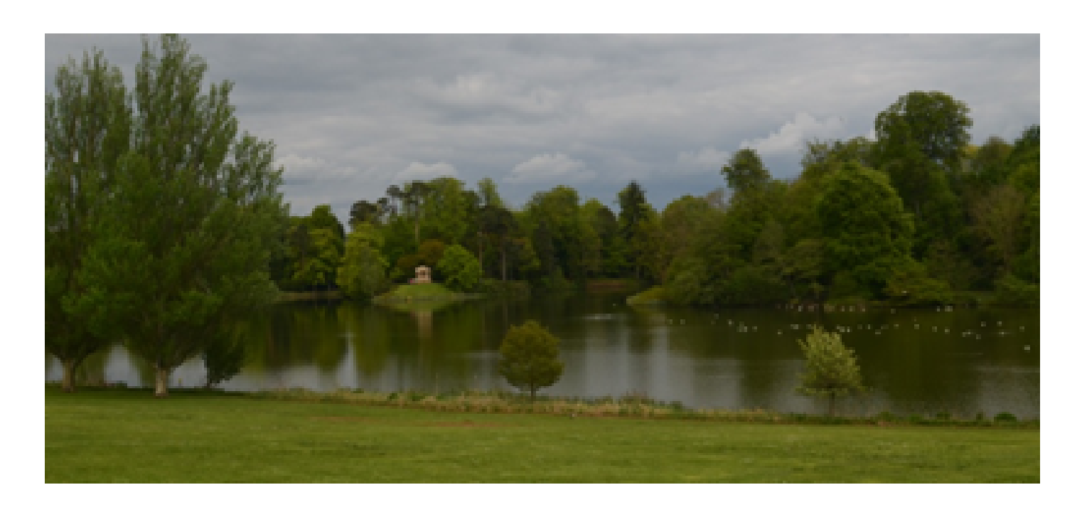
Bowood House, park designed by Lancelot 'Capability' Brown in the 1760s for William Petty, 2nd Earl of Shelburne, politician and ultimately prime minister, 1782-83

The Paul Mellon Centre also hosts a series of online lecture courses on the 'Artist and the Garden'.